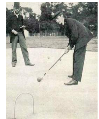
1900 Olympic Games